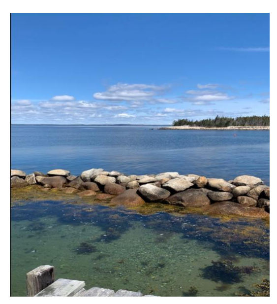
Nova Scotia East Coast