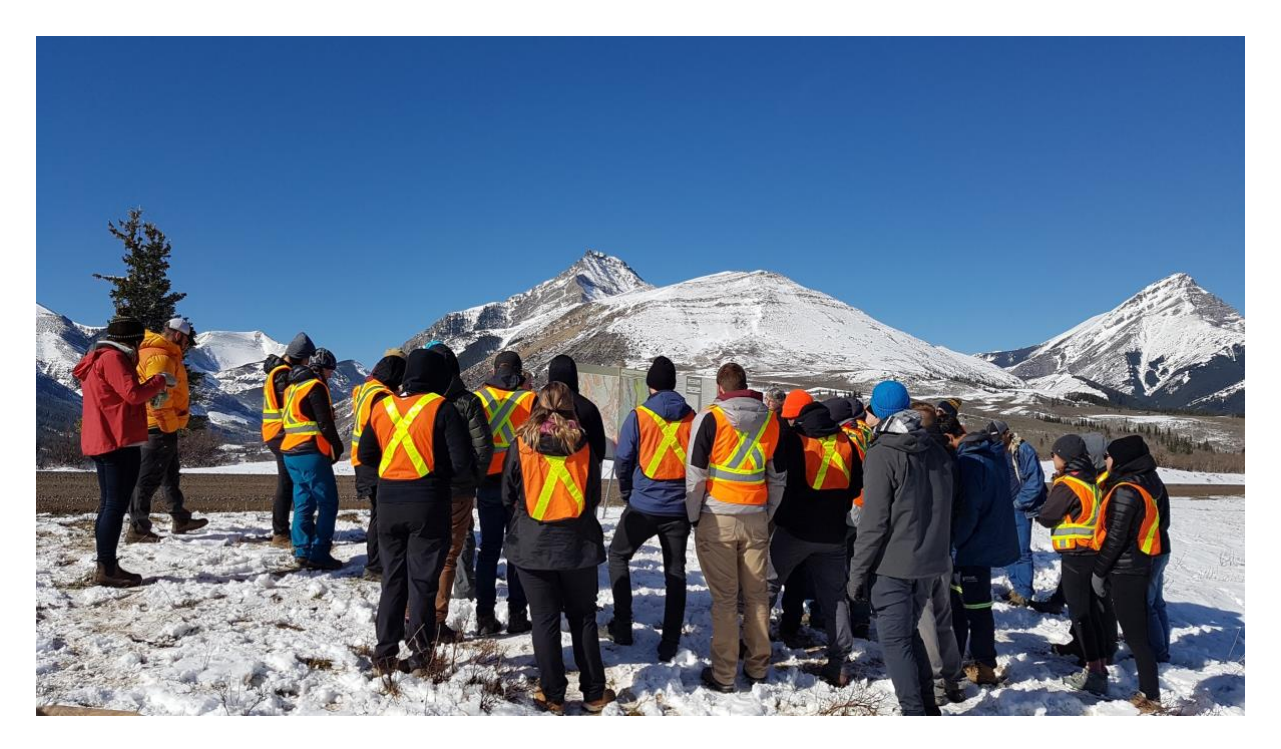
Student Industry Field Trip - Rocky Mountains