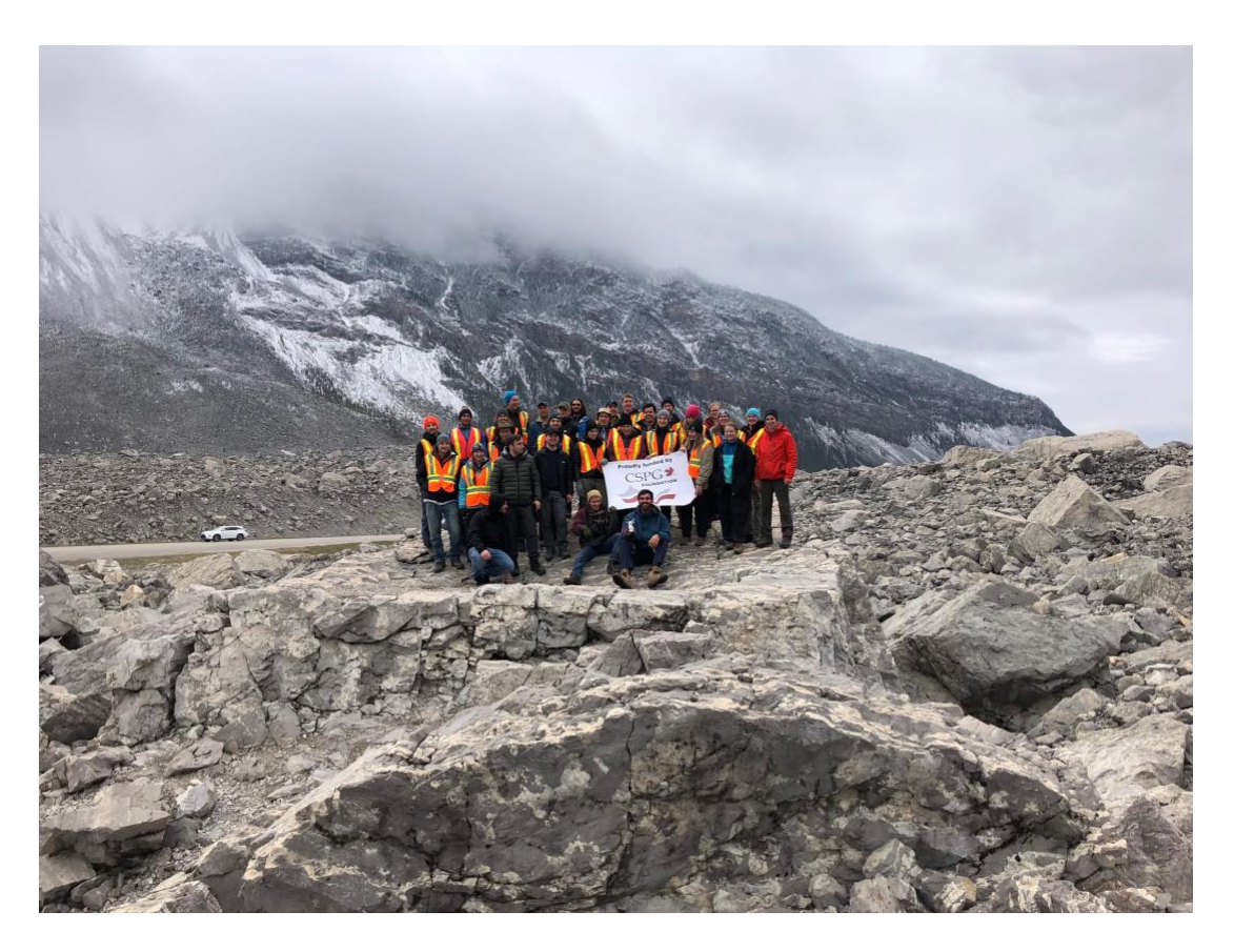
Student Industry Field Trip - Rocky Mountains