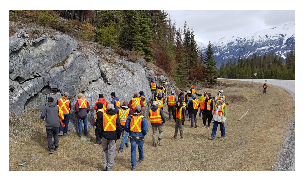
Student Industry Field Trip - Rocky Mountains