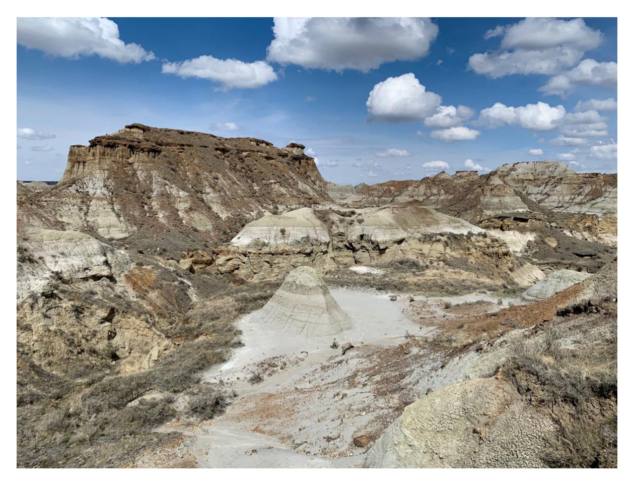
Student Industry Field Trip - Dinosaur Heritage Site, Alberta