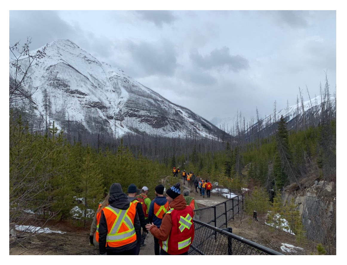
Student Industry Field Trip - Rocky Mountains