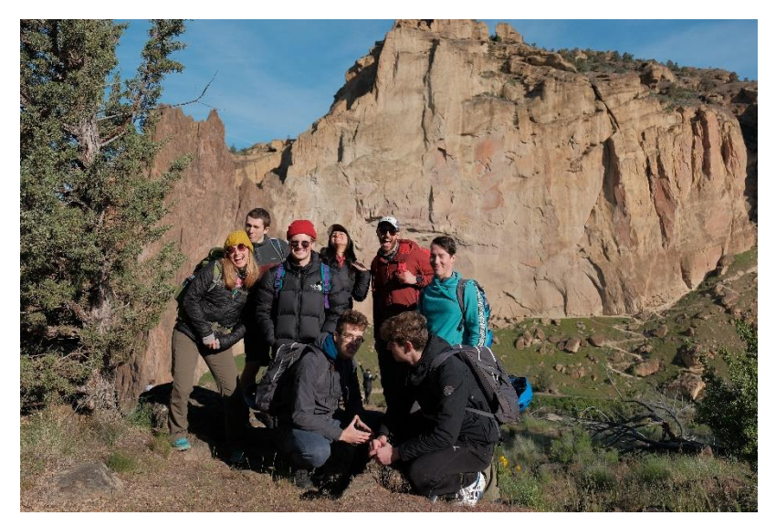
Figure 5: Climbing at Smith Rock State Park with the PSU Outdoor Program.