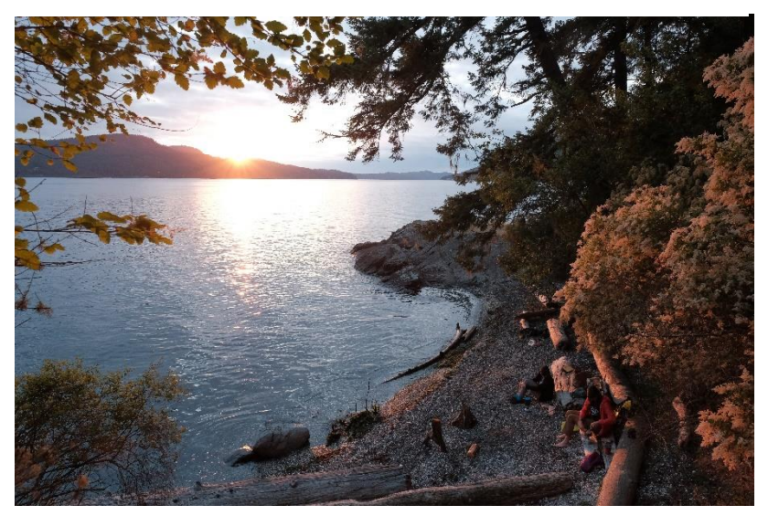
Figure 6: Bike touring across the San Juan Islands.

I also want to note that Portland State University offers many resources besides the classes that one takes. I would encourage future outgoings to take advantage of the many opportunities at PSU right from the start. Since it might feel overwhelming in the beginning that there are so many possibilities, I want to mention the writing centre, the PSU food pantry, the Students Sustainability Centre, the Outdoor Program and the Recreational Centre. Above these, there are all kinds of student run committees, ranging from a cycle group, over magazines to several culturally or politically oriented ones. Engaging in one of them, enables one to connect more to the campus community