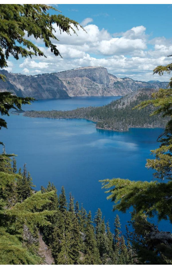
Figure 3: The Columbia river Gorge, Mt. Hood or Crater Lake are inviting for weekend trips.

Naively, I did not expect too many cultural differences, since I had already American friends in Freiburg and the American way of living seems well known through its