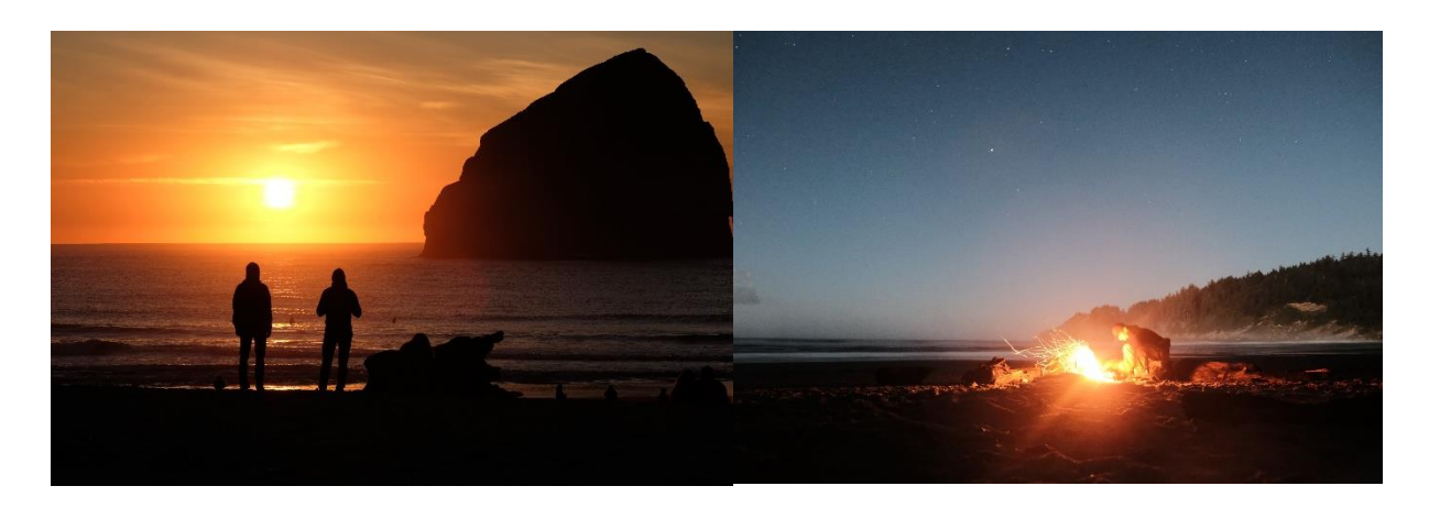
Figure 2: Sunsets at the Pacific, just 2 hours from Portland.