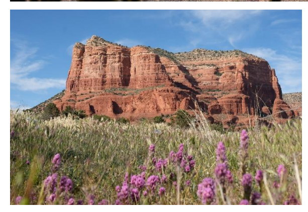
Figure 4: Traveling in Arizona, visiting the Grand Canyon and Sedona

for as many credits as I would have done in Freiburg for a year. The class format was generally were similar to what I was used to in the LAS program. They were also characterised by small class sizes, close contact to professors and many readings and assignments throughout the term. The range of